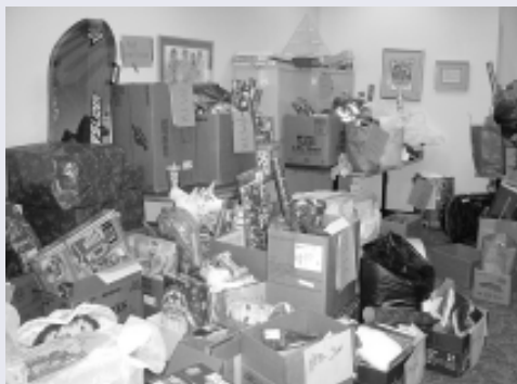
The Parent Room at Families First was filled from floor to ceiling with gifts for more than 100 families during the week before Christmas.